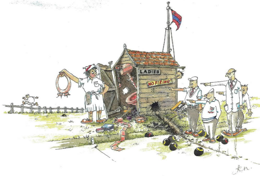
Drawing by our late member Don East