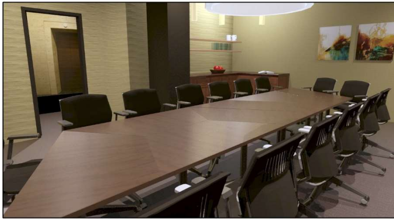
3 BOARD ROOM PERSPECTIVE NOT TO SCALE