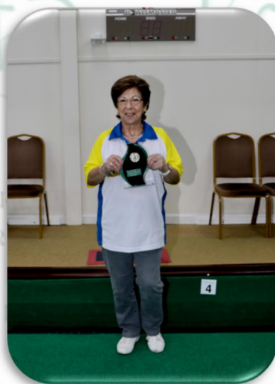
Top 10 players